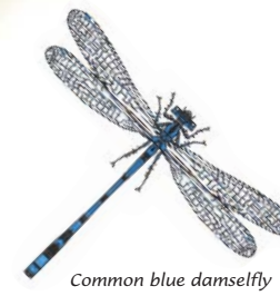
Common blue damselfly