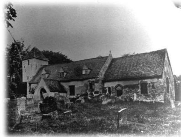
Stones from St Andrew's Church were used when building All Saints Church.

Countryside Services Huntingdonshire DISTRICT COUNCIL