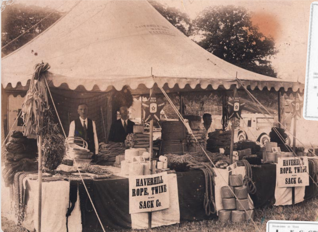
Above: Haverhill Rope, Twine and Sack Company display at a local agricultural show