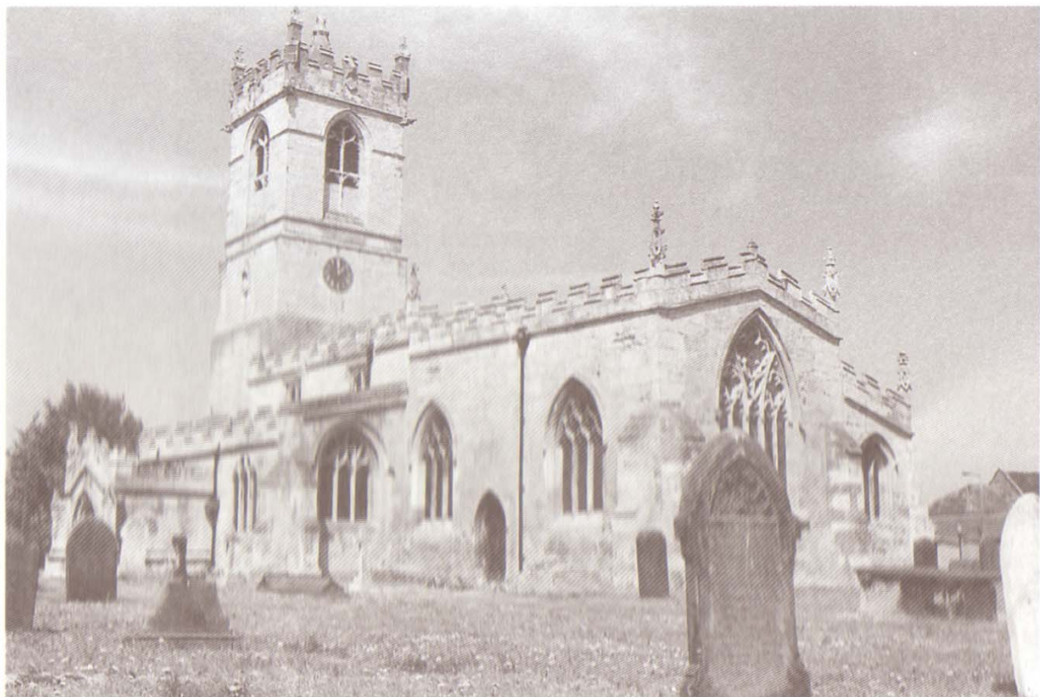
Fig 21. Barnburgh Church today