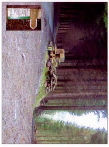
Loading area and Waymark