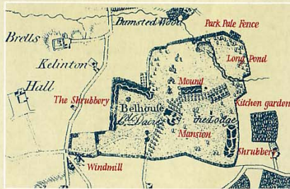
The Belhus Park Estate Map of 1619

Sewage from Belhus Mansion was taken through an underground pipe, which is still beneath the ground, to a point close to this ornate chimney. The chimney or 'Stench Pipe' was constructed early in 19th century to draw off foul air from the sewer to such a height that people could not smell it. The decorative bricks used in its construction may have been made from the brickworks that once operated in the Whitehall Wood which is now part of Belhus Woods Country Park. The Stench Pipe is now a listed structure and is protected by law.