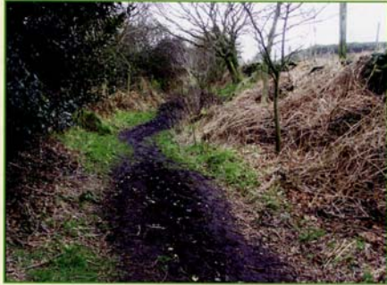
The project was funded with grants from The Local Heritage Initiative, Lancashire County Council Green Partnership, Chorley Borough Council and Whittle-le-Woods Parish Council.