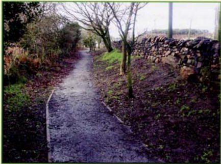
Carwood Lane footpath is known locally as "The Caradise". The derivation is unknown but may be named after a former quarry owner or could be a corruption of Carwood House Lane which is the name on the 1931 Ordnance Survey map.