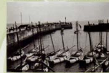
Bridlington Harbour full of cobs

However, this cannot happen without a massive amount of help, both in skills required to maintain her in a seaworthy condition, and cash to pay for the ever spiraling costs of materials and equipment.