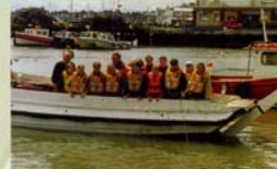
Members of the Society and some CCF cadets

The Three Brothers is comprehensively equipped with standard safety equipment, as well as that required under schedules for navigation and seamanship. Sailing conditions are carefully monitored, and the whole authority rests upon the Harbour Master, and the technical sailing committee of the society.