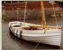
After restoration in 1983 by the Harbour Commissioners