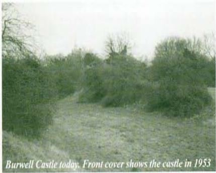
Burwell Castle today. Front cover shows the castle in 1953

The name Burwell, first recorded in 1060 as Burcwell means 'spring by the castle', but interestingly the only castle known to be associated with Burwell, to date, is the Anarchy Castle built by King Stephen 83 years later in 1143. It could be that the castle referred to is in fact a much earlier Iron Age fen-edge fort.