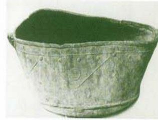
Roman Lead Christening vat found nearby

Early Christians frequently utilised and rededicated existing sacred sites and festivals, and the fact that early Roman Christians chose to use the waters from this spring for