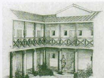
Courtyard garden of a

The name Burwell could also refer to an early Saxon centre or 'burgh', a possible location for which lies on the area of land between High Street and Mandeville where St Mary's church is located (and where the spring emerges from the ground).