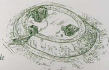
A typical 'anarchy' castle

Stephen ordered castles to be built around the fens to surround Geoffrey, demanding land and workers from local landowners. Fortifications were generally shortlived and some, such as that at Burwell (where Geoffrey was mortally wounded), were never completed.