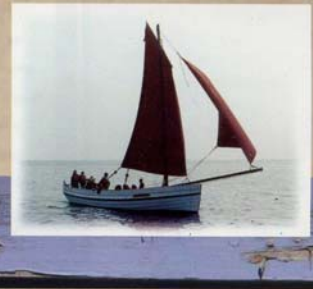
The Three Brothers Historic Sailing Coble

On your journey back in time you'll discover a Bridlington far removed from parts of Bridlington you know so well today. A rich collection of artifacts, photographs and memorabilia which represents hundreds of years of Bridlington's maritime past.