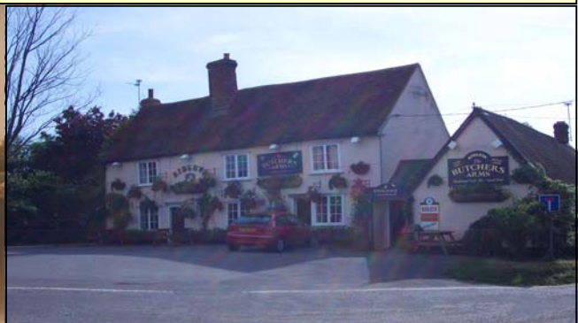
The Butchers Arms in the early 1900s... ...and now