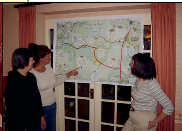
The first full size mock up of the map.

This is the final digital version of the map which includes illustrations, house names or numbers, footpaths and historical notes. In this format it can be printed, then encased in laminate and framed before it is finally attached to the notice board.