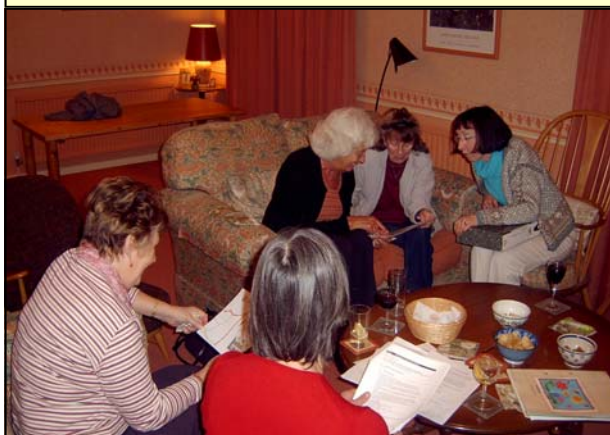
The map group looking at samples of the map.