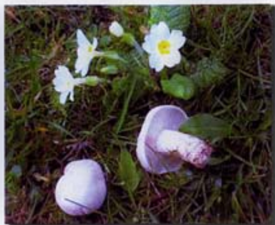
St George's mushroom

St George's Pond - There were two ponds on what is now Penn Street Common and one or both were called St George's, named after an edible spring mushroom called Calocybe gambosa . Its old name was Agaricus georgii , and it still appears by the pond around St George's Day on 23 April. The name of the mushroom first appears in print in 1601, but the pond name could date back as far as 1222, when 23 April was made St George's feast day by the Church. He became the patron saint of England in the 14 th C.