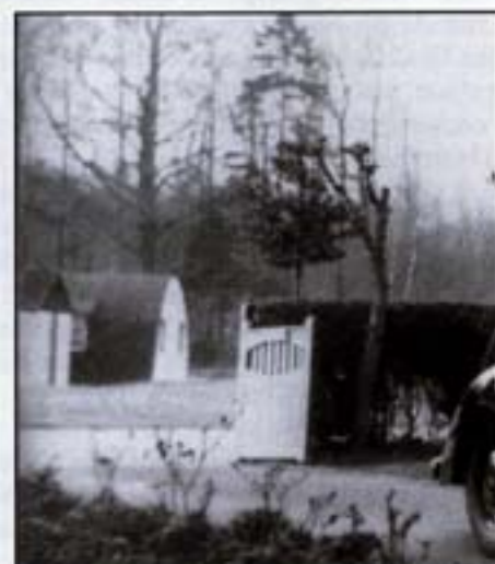
Army Nissen huts on the common, c.1950