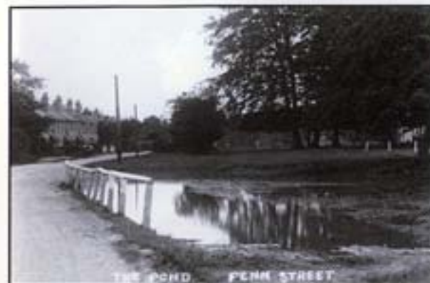
The Pond in 1914 when the water came right up to the road. The water level in the pond varies greatly with the season. (Postcard from Colin Seabright)

Aquatic plants include rigid hornwort, curly water-thyme, spiked water-milfoil, water-lily species and broad-leaved pondweed. Highly invasive New Zealand pygmyweed has been very hard to eradicate.