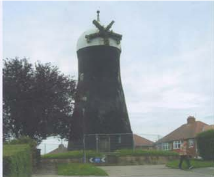
Holgate Windmill today - ringed about with houses, denuded of its sails and fantail.