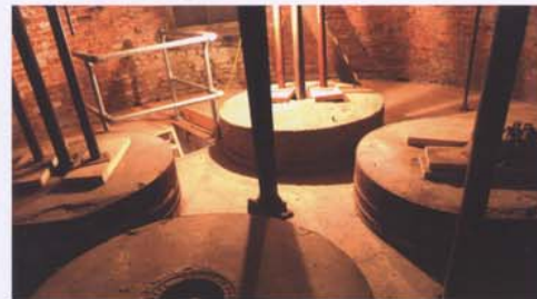
A recent photograph of the millstones

Become a member of Holgate Windmill Preservation Society. At only £5.00 per year, per family, this entitles you to attend our Annual General Meeting and to receive our bi-annual newsletter to keep you up to date with our progress.