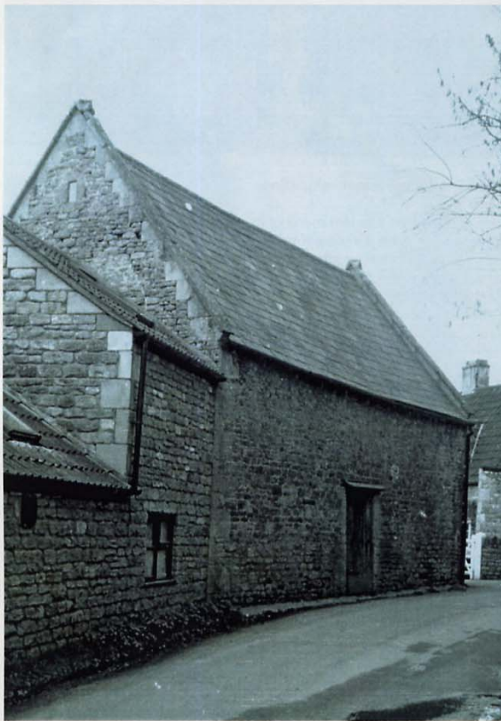
2. A late 18th Century combination barn

In relation to agricultural activities in Batheaston, past and present, three barns have been surveyed; one of which is still in active farm use, one is semi derelict and is scheduled to be converted into a dwelling and the last has been converted into a studio although its former agricultural usage is still discernible. Four other barns are believed to be extant in Batheaston but three of these have already been converted into residences. As befits a pasture economy, one of the surveyed barns is of the combination type, that is a ground floor area for keeping animals and an elevated platform area for storage, one is a traditional threshing barn with large opposed doors and other is a threshing barn converted to keep cattle.