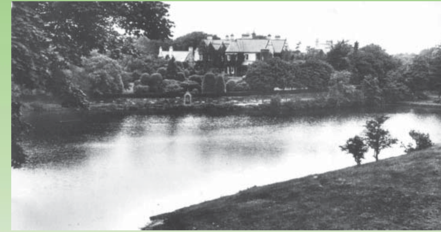
A view of Baycliffe, the large manor house which stood on the current site of the road of this name. The house, which was the home of the Bounphrey family, was demolished in the 1950's but the wall and doorway alongside the Dam in the photograph still stand.