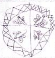
Drawings of tiles from St Mary's Church

Come, come, come to Wirksworth Go up to The Dale. If it starts to rain and snow It might just start to hail!